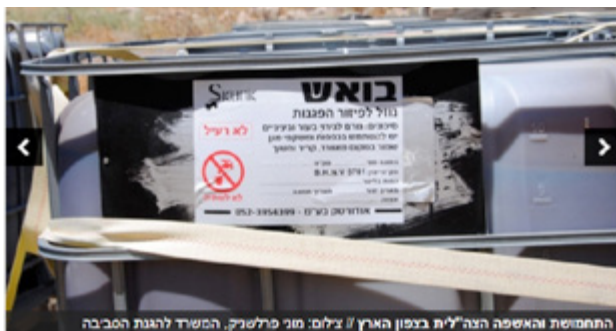
In an inspection tour conducted by the Israeli Ministry of Environmental Protection in September 2013, tankers containing the Skunk liquid were found stored in a field in the Golan Heights. According to the manufacturer's safety data sheet, containers must be stored in a closed and well-ventilated area and not exposed to sunlight. 65 Photo by the Ministry of Environmental Protection. 66

The Skunk was developed by the Technological Development Department of the Israel Police, in collaboration with Odortec LTD an Israeli company that specializes in the research and development of scent-based repellents for law enforcement. In an article from 2008, the head of the police department in charge of developing the Skunk noted that the police and Odortec were conducting negotiations so that Odortec would be the supplier, and in return the Israel Police would enjoy a considerable discount. 63 The Israeli police and Odortec are currently considering the development of a personal Skunk for police officers 64 .